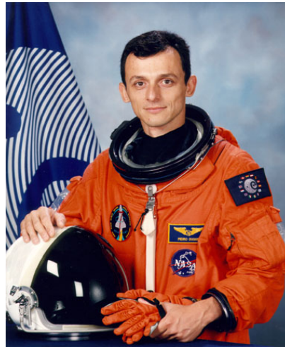
Astronaut Duque with blue ESA flag