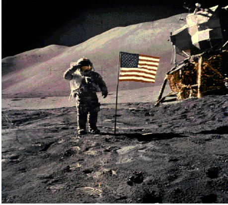
USA flag on the Moon